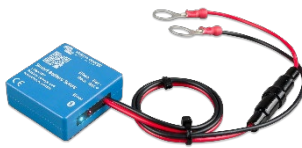
Bluetooth sensing Smart Battery Sense