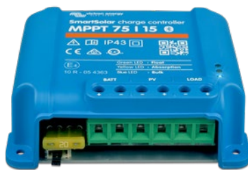
SmartSolar Charge Controller MPPT 75/15