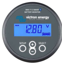
Bluetooth sensing BMV-712 Smart Battery Monitor